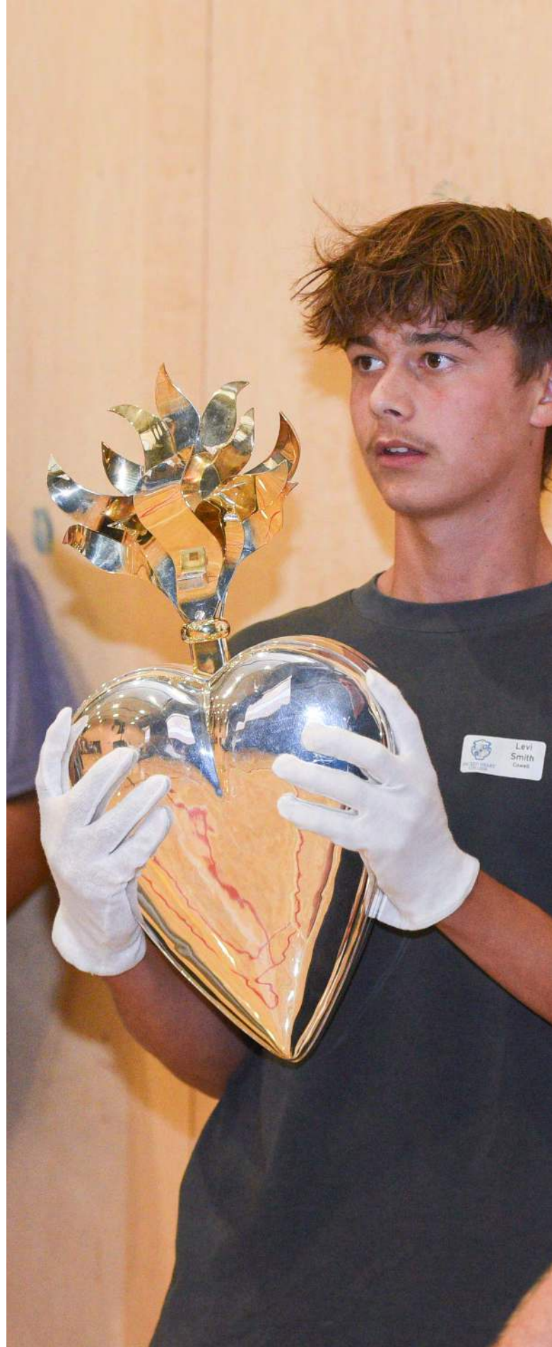
Adapted from 'In the Footsteps of Marcellin Champagnat: A Vision for Marist Education Today' (1998) Institute of the Marist Brothers of the Schools.

Our community partakes in the opportunity to live In the Way of Mary. Inspired by the example of Mary, we engage in our relationships and the world around us with tenderness, strength and devotion.